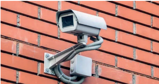
Safety & Security