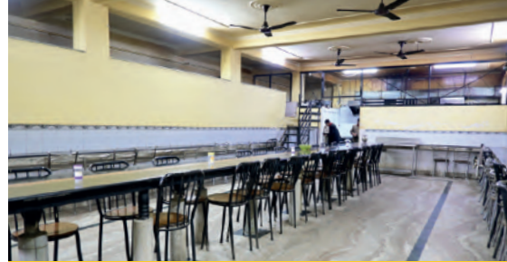
Veg. & Non-Veg. Meals